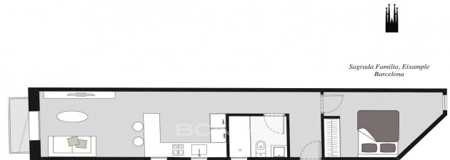
Sagrada Família, Eixample Barcelona

*Previews of optional layouts are available upon request.