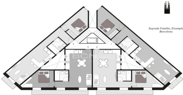
Sagrada Família, Eixample Barcelona